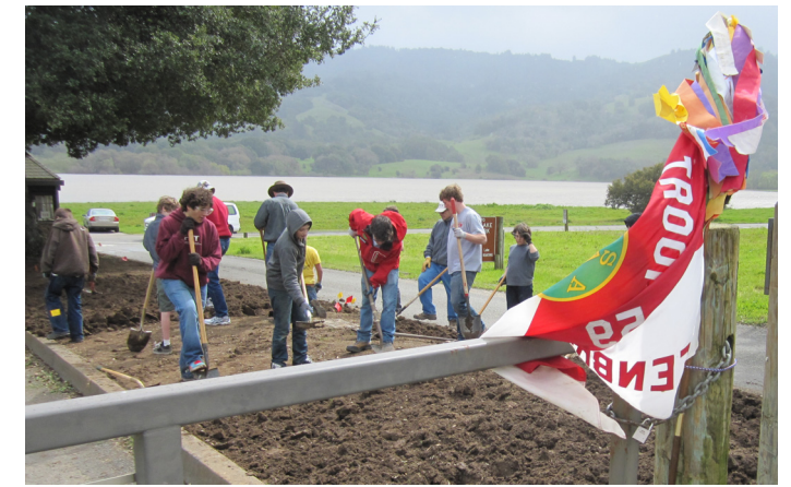
Eagle Scout team improves entrance to Stafford Lake Park.

In the past year, 14 local Boy Scouts have achieved Eagle rank as leaders of improvement projects that benefit all who use Marin County Parks and Open Space. They have built and maintained trails, repaired facilities, planted native vegetation, constructed fences, installed irrigation, and renovated landscapes and picnic areas.