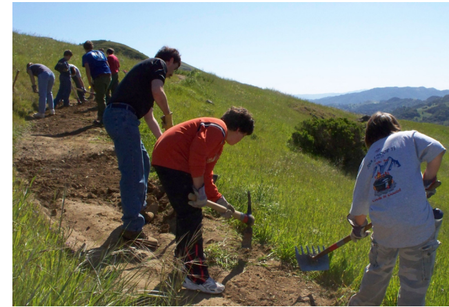
Scout crew works on Big Rock Trail.