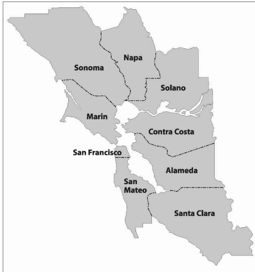
FIGURE 1. NINE-COUNTY SAN FRANCISCO BAY AREA

Adoption and implementation of Plan Bay Area 2050+ has the potential to result in environmental effects in all the environmental impact areas identified in CEQA. For this reason, the Plan Bay Area 2050+ EIR will be a “full scope” document and will analyze all the required CEQA environmental issue areas. These include: aesthetics; agriculture and forestry resources; air quality; biological resources; cultural resources; energy; geology and soils; greenhouse gas emissions; hazards and hazardous materials; hydrology and water quality; land use and planning; mineral resources; noise; population and housing; public services; recreation; transportation/traffic; tribal cultural resources; utilities and other service systems; and wildfire. The EIR will also address cumulative effects, growth inducing impacts and other issues required by CEQA.