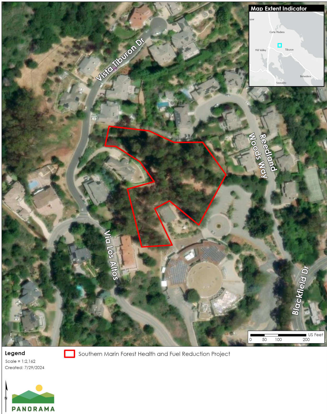
Figure 1 Proposed Project Location