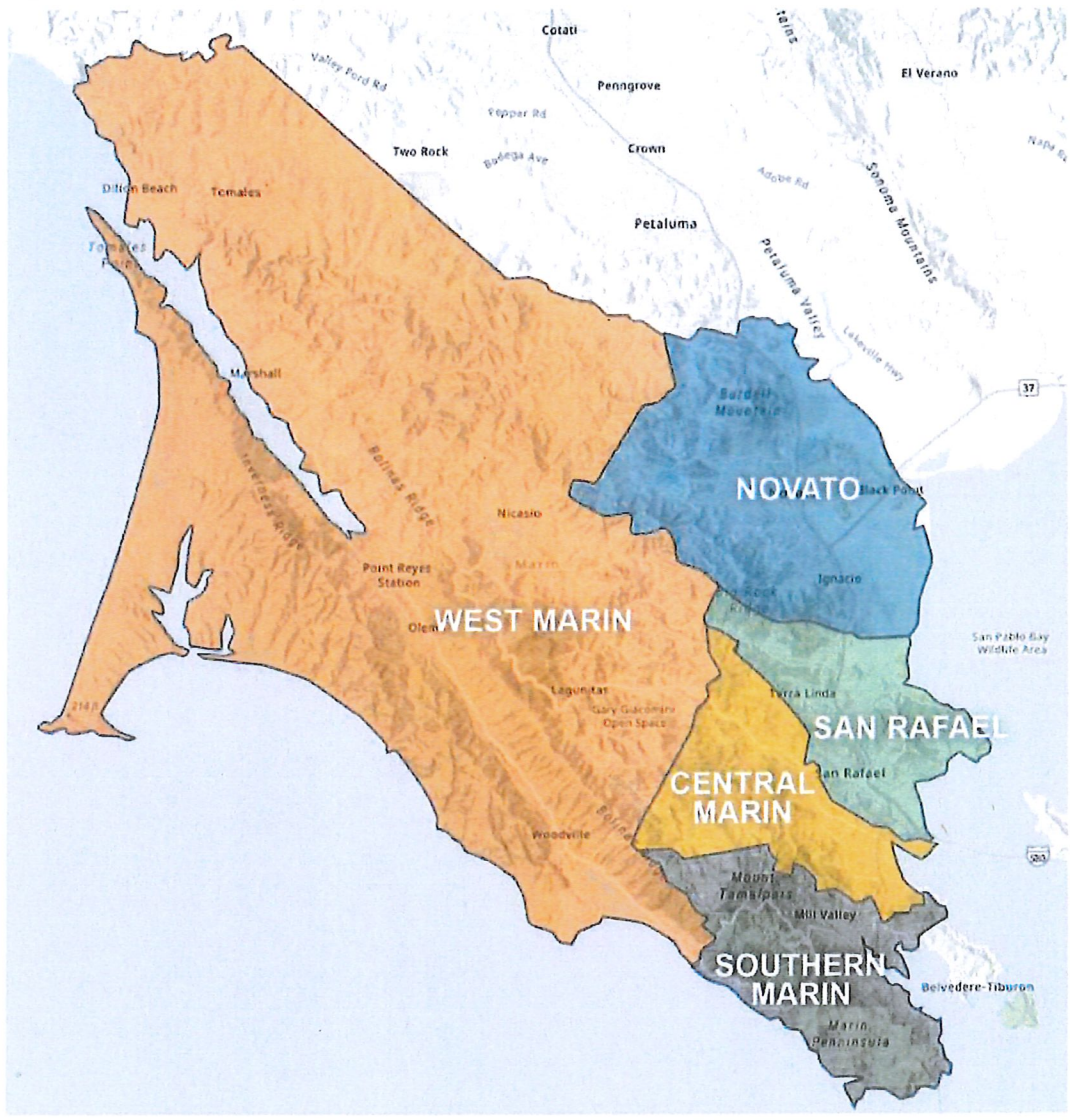
Figure 1 JPA Operational Boundaries: Five Geographic Zones