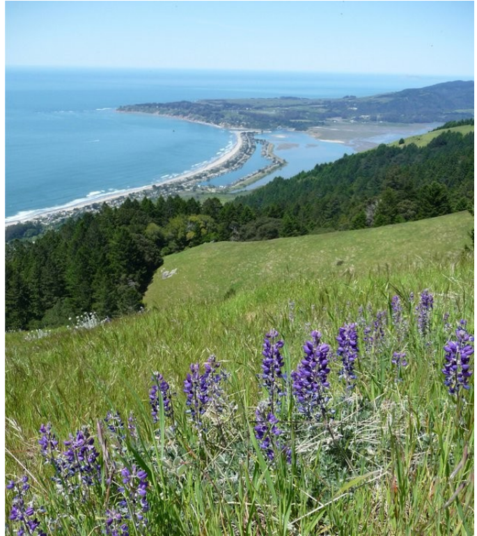
View from ridge over Bolinas Lagoon and coast.